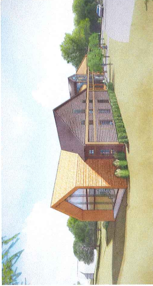
VIEW FROM SITE ENTRY