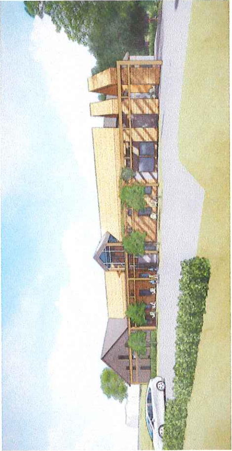
VIEW FROM PARKING LOT