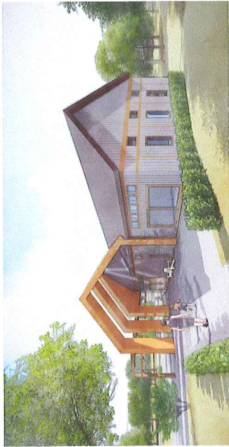
VIEW FROM PARK