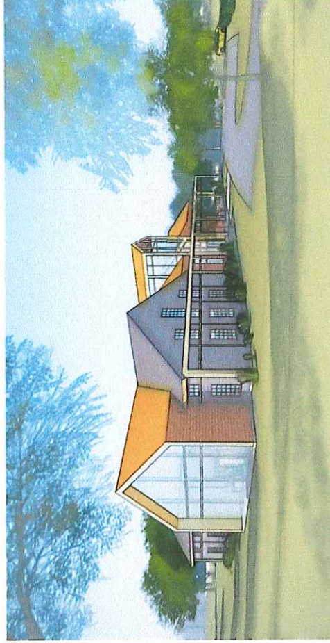
VIEW FROM SITE ENTRY