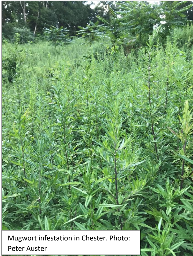
Mugwort infestation in Chester.

General identification and look-alikes: Common mugwort can grow from 2 to 6 feet tall. Young plants emerge in spring as a rosette of leaves, and stems persist into winter. The leaves on the spring rosette and on the lower part of mature plants resemble both chrysanthemum and common ragweed.