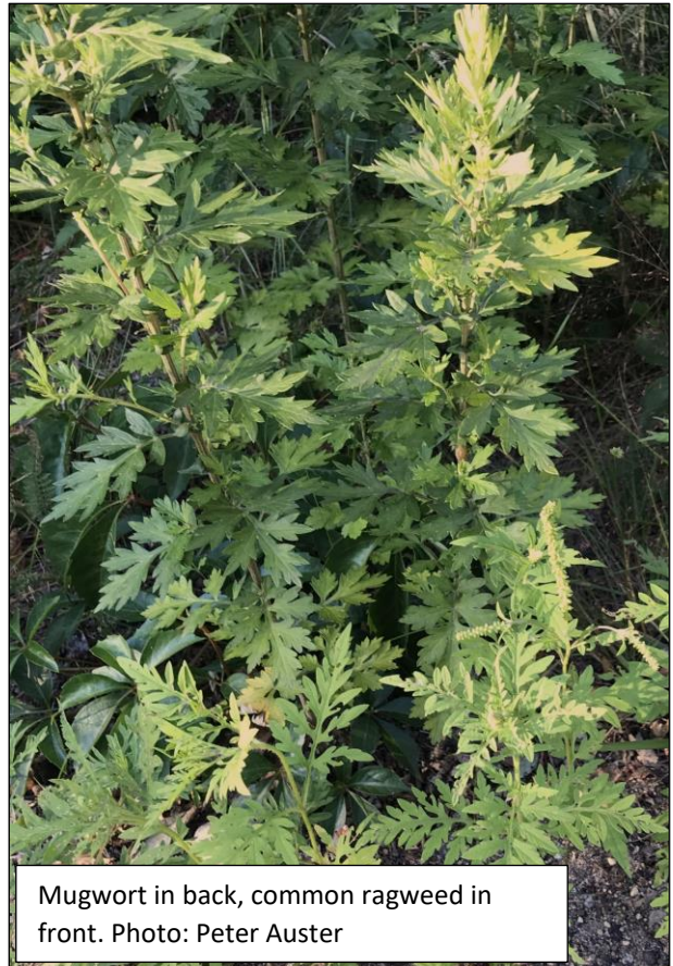
Mugwort in back, common ragweed in front.