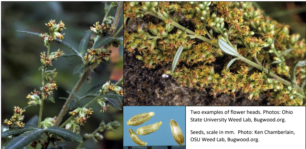
Two examples of flower heads.

Leaves: The fragrant leaves are smooth to slightly hairy on top and covered with woolly, silver-white hairs on the underside. On the lower part of the plant they are lobed with coarse teeth. The upper leaves are lance-shaped with smooth or slightly toothed margins.