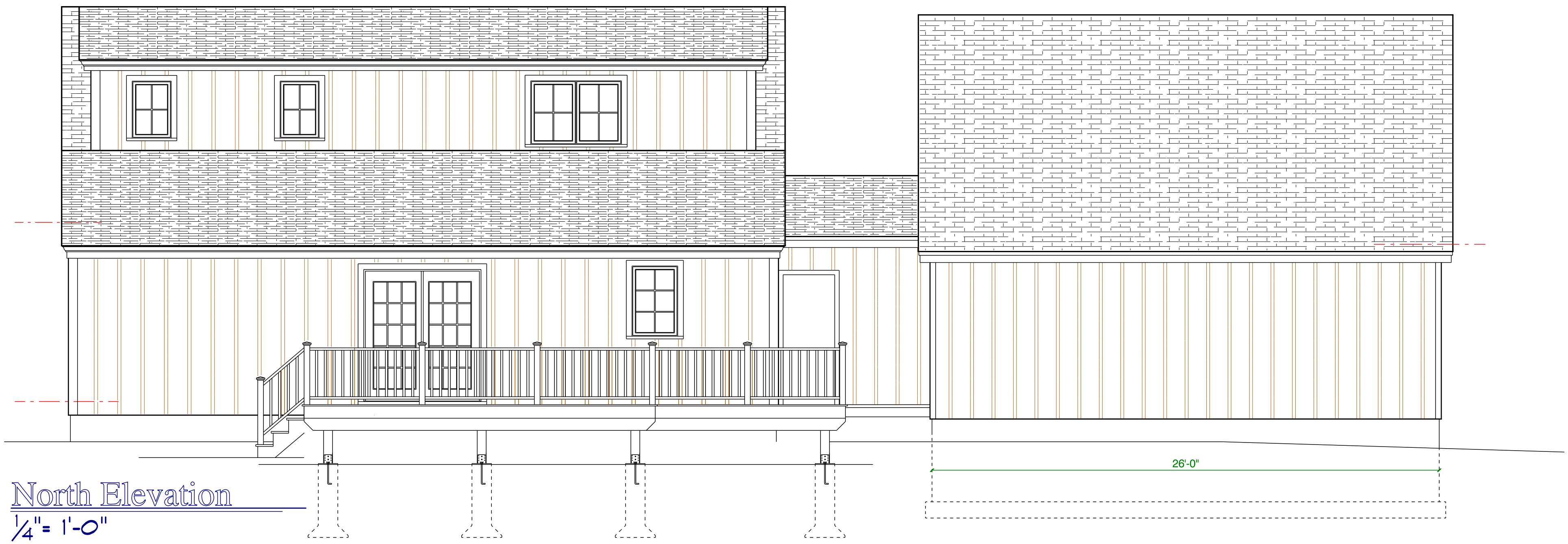
North Elevation \frac{1}{4}'' = 1'-0''